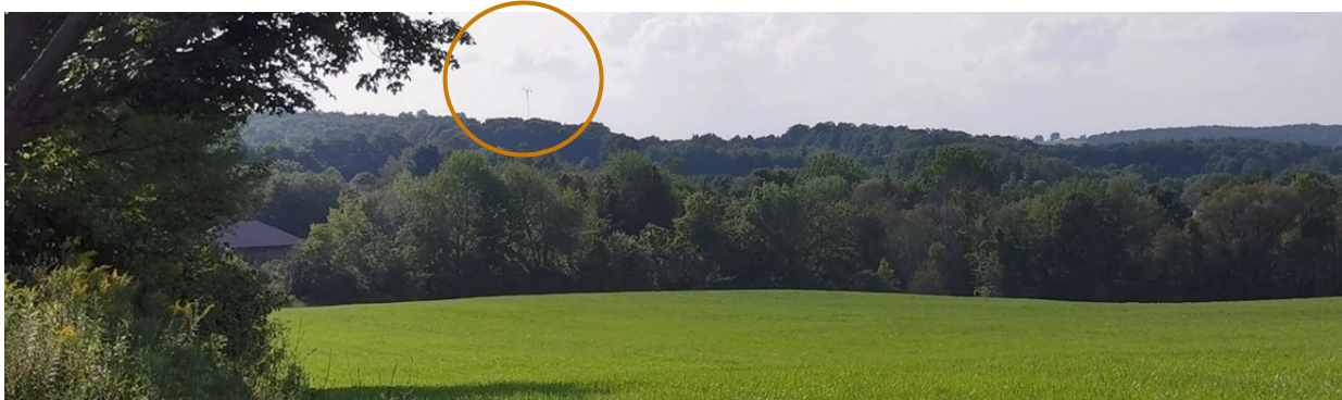
Small wind turbine located off Canty Hill Road, Town of Otisco, from approximately 3,800 ft./0.75 mi. away.

While there is some concern regarding potential visual impacts of small wind turbines associated with their height, they are relatively small objects within the landscape and their visual impact is often reduced by woodland, hedgerows, and roadside vegetation. The following photo shows a small wind turbine located off Canty Hill Road in the Town of Otisco, viewed from a point on Otisco Road approximately 3,800 ft./0.75 mi. away.